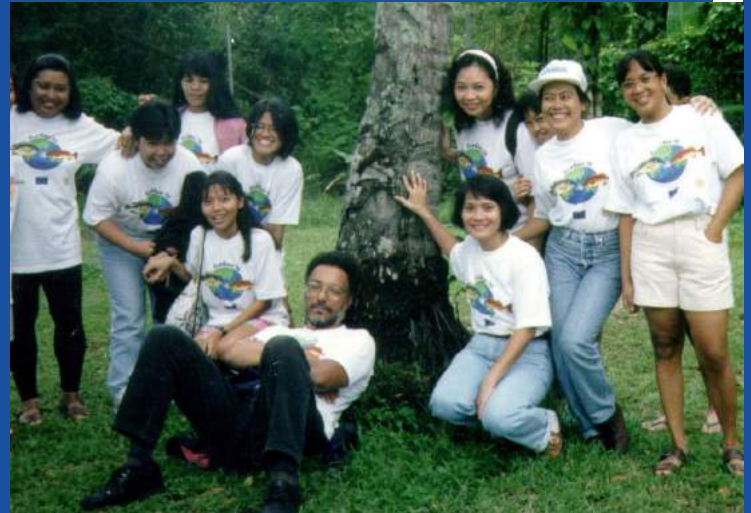
An outing of the FishBase team in the 1990s.

“I look forward to the continuing service of FishBase and SeaLifeBase, two resources that make relevant information on aquatic species accessible to everyone”