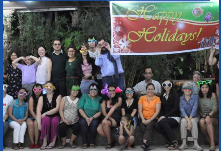
Skit loves the camaraderie that reigns within the FishBase/SeaLifeBase team. She particularly remembers a holiday party organized by the IT Group where everyone wore fun eyewear.

Reflecting on what she hopes for the future of these two databases, Skit can only think about a famous quote from a beloved movie character: "To infinity and beyond!"