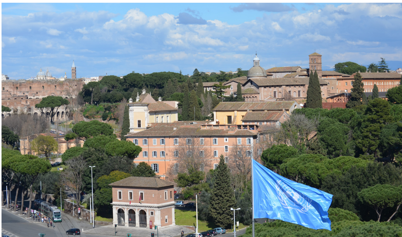
A beautiful view of Rome from the United Nations Food and Agriculture Organization's (FAO) headquarters (© D. Belhabib).