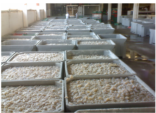
Processed jellyfish nearly ready for export to Asia.