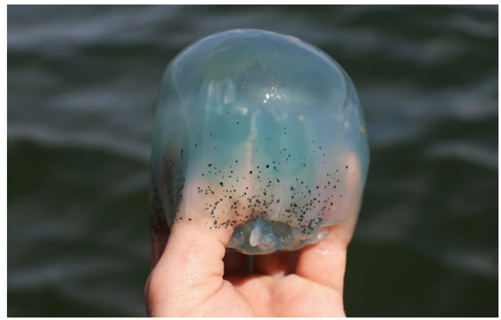
Here's what all the fuss is about — cannonball jellyfish Stomolophus meleagris