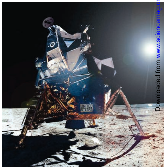
Eagle on the Moon. The Apollo 11 Landing Module, July 1969.

I was left with a sour taste by the film’s treatment of religion, near its end. Gene Cernan talks about a general creator “that stands above the religions that govern our lives,” and then Charlie Duke tells about finding Jesus. How about the other 10 Moon-landing astronauts? Did any lose religion or decide that religion was