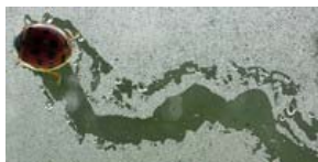
Ladybugs are cute, but ... maybe not inside