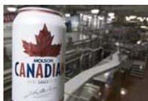
NHL, Molson Canadian sign 'monster' deal