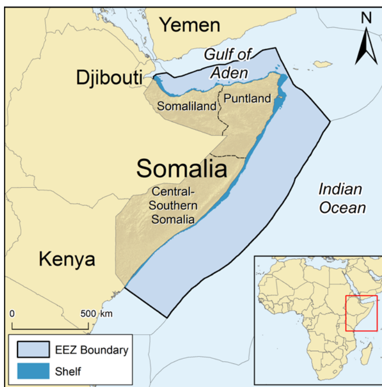
Figure 1: The Exclusive Economic Zone (EEZ) of Somalia, based on general UNCLOS principles, and the shelf waters to 200 m depth.