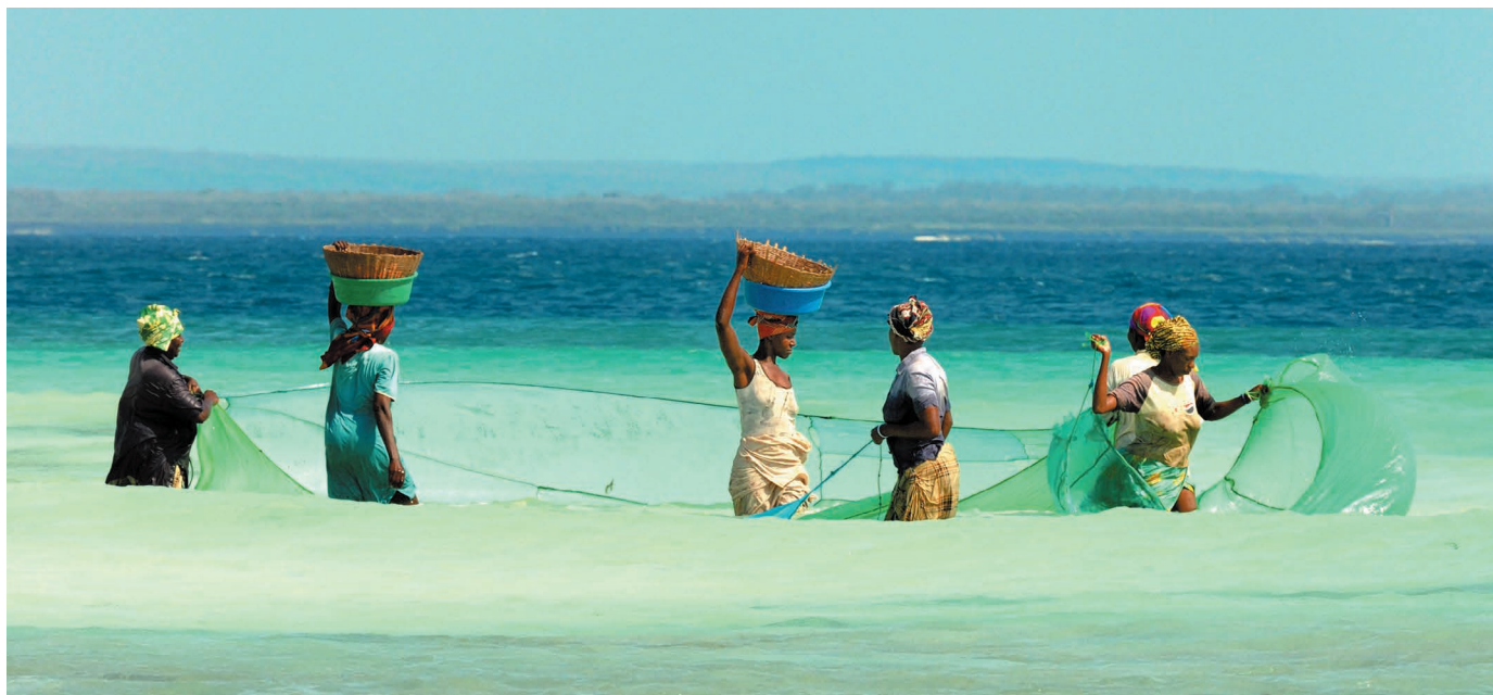
Women from a traditional sea-harvesting community fishing in Mozambique.