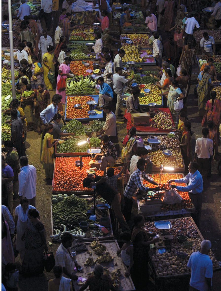
Solar lights are used by vendors in rural western India, where lack of electricity has stymied development.

Full author details and Supplementary Information accompany this article online at go.nature.com/25oll0p .