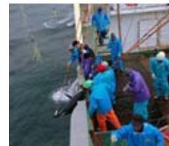
Japanese longline fishers catch southern bluefin tuna from waters near New Zealand.