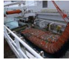
A trawl net carrying some 100 tons of Alaskan pollock is brought aboard a U.S. vessel.

The 1998 paper relied on four decades of catch data and averaged the trophic levels of what was caught.