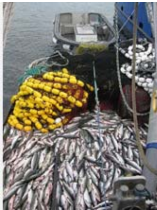
A load of salmon from Prince William Sound, Alaska, awaits delivery to a fish tender.

Inaccurate conclusions may have been reached in many ecosystems