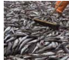
A broom is used to move Alaskan pollock on the deck of a ship.