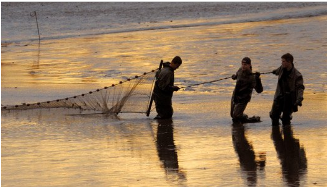
POND FISHING: Fishermen start to fish the pond of Moritz castel out near Dresden, Germany, 15 November 2010.

VANCOUVER - The world's fishing industry is fast running out of new ocean fishing grounds to exploit as it depletes existing areas through unsustainable harvesting practices, according to a study published Thursday.